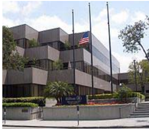
The former Hilton Hotels Corporation headquarters in Beverly Hills