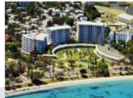
Hilton Noumea La Promenade Residences