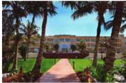
Hilton Al Hamra Beach & Golf Resort