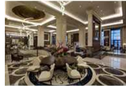
Hilton Istanbul Bomonti Hotel & Conference Center